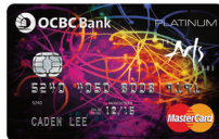
OCBC Arts Platinum Card